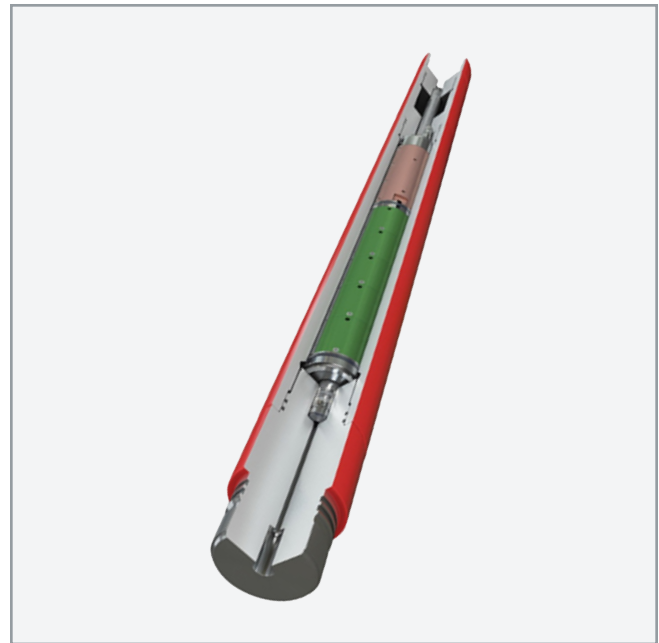
Shock Sensing Sub

Multiple flow and shut-in periods can be achieved by manipulating the ROCT and data recorded via the electronic downhole gauges. The data is used for analysis, giving the operator a formation interpretation, including permeability, reservoir pressure, formation damage, and reservoir anomalies. Real-time telemetry can also be added to the string to monitor flow and shut-in periods, enabling the operator to reduce or extend these periods when adequate data has been obtained and reducing rig time and costs.